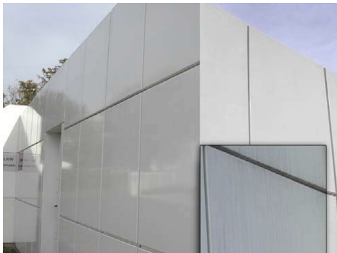
A coated Alu-façade after coating with UniCoat 2k Lacquer. (the section shows the degree of dirt before)