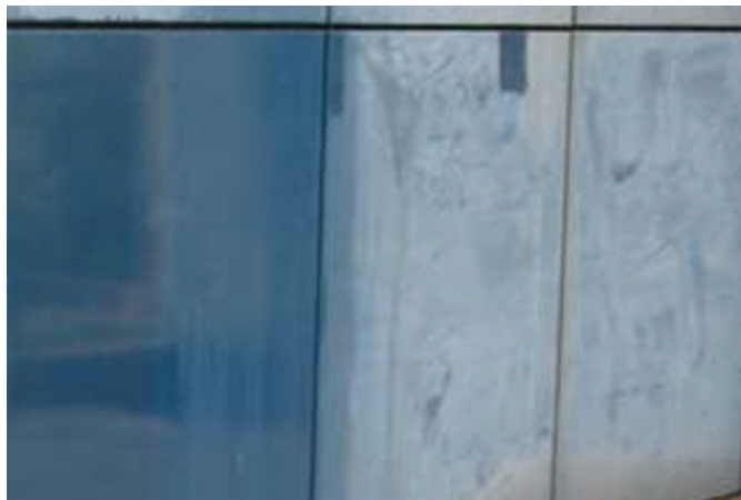
A bleached surface - before and after coating with UniCoat 2k Lacquer